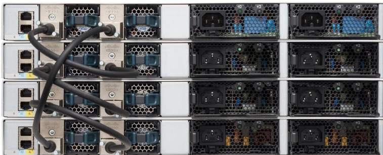
Figure 4. Cisco Catalyst 9200 Series Switch stacked units