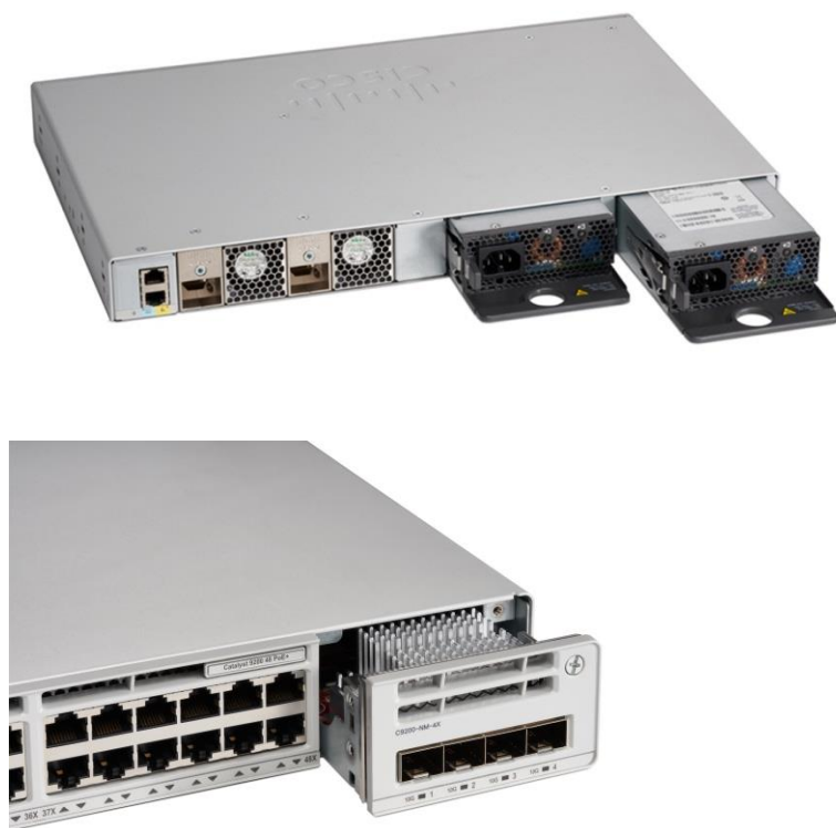
Figure 3. Cisco Catalyst 9200 Series Switch dual redundant power supplies